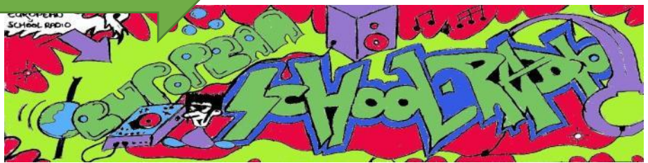
Graffiti (2010): Λελάκης Δημήτρης, former student